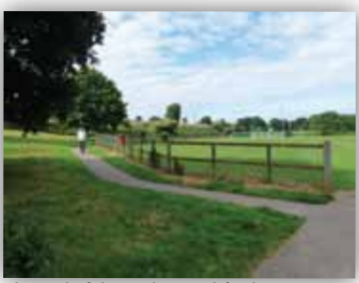
The end of the trail in Washford.

9 Keep following the path straight on. After a while you will see a tiny bridge on the right which allows cattle to pass under the West Somerset Railway line.