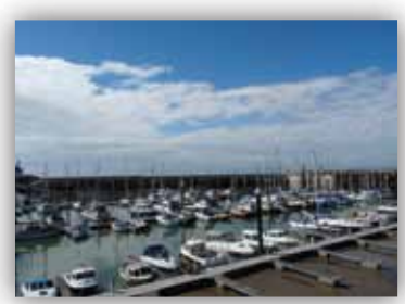
The view of West Pier from the Esplanade.

Start on the Esplanade in Watchet, from where there is an excellent view of the harbour, and the West Pier, from which ore was offloaded into waiting ships bound for Wales.