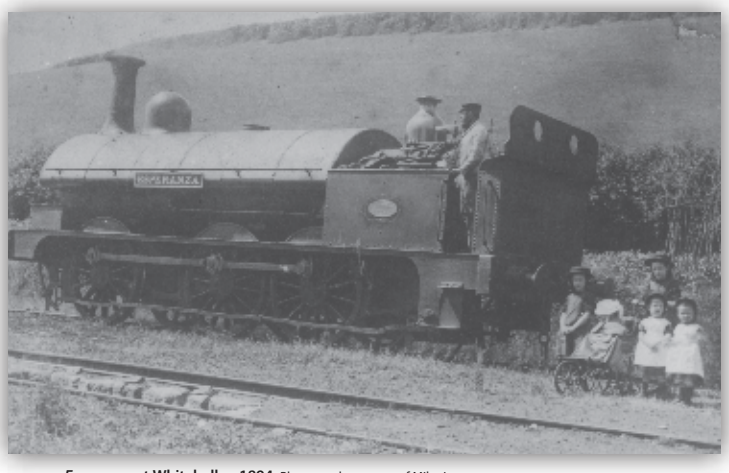
Esperanza at Whitehall, c. 1894.

By the 1870s, more than two hundred men from Somerset and Cornwall were employed in the mines and on the railway, and they formed new communities along the "Old Mineral Line". Although built specifically to transport ore, the railway was opened to passengers in 1865. This bold industrial venture had a profound effect on the rural landscape and local economy.