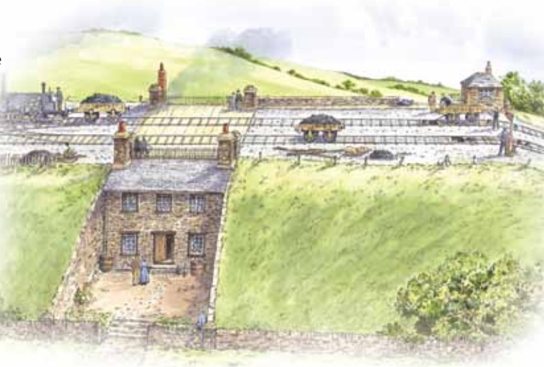
An artist's reconstruction of the Incline and Winding House.

Watchet Market House Museum has a working model of the Incline, as well as a model of the Lizzie , which transported iron ore to Wales.